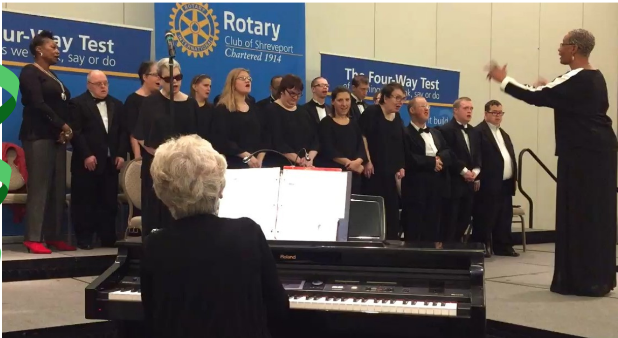
The Holy Angels Choir!